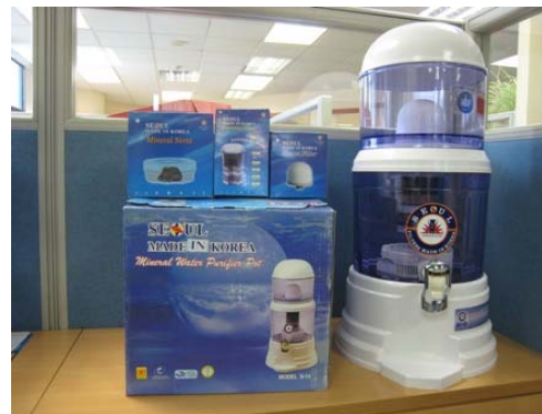
Mineral Water Purifier