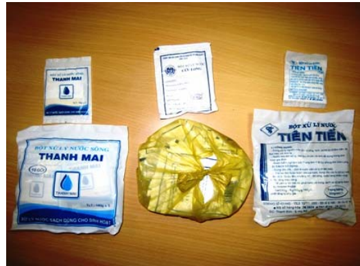
Water Treatment Powders