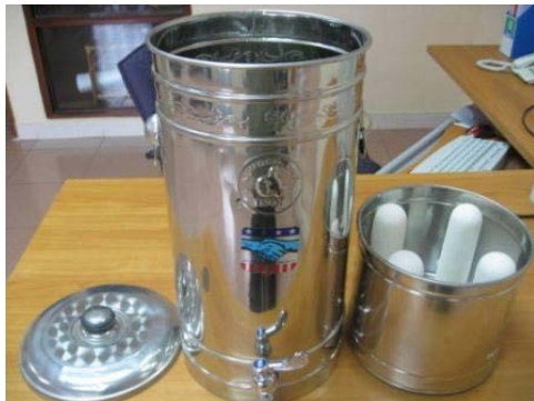
Candles Ceramic Filter