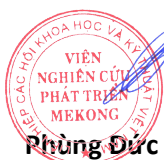
Phùng Đức Tùng